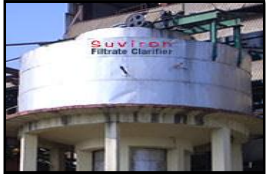
Sugarcane Juice clarifier