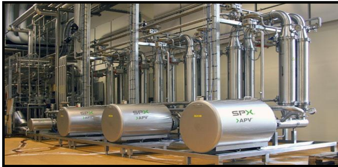
Micro filtration for Juice